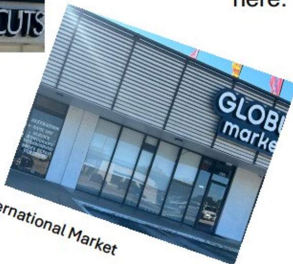
Globus International Market