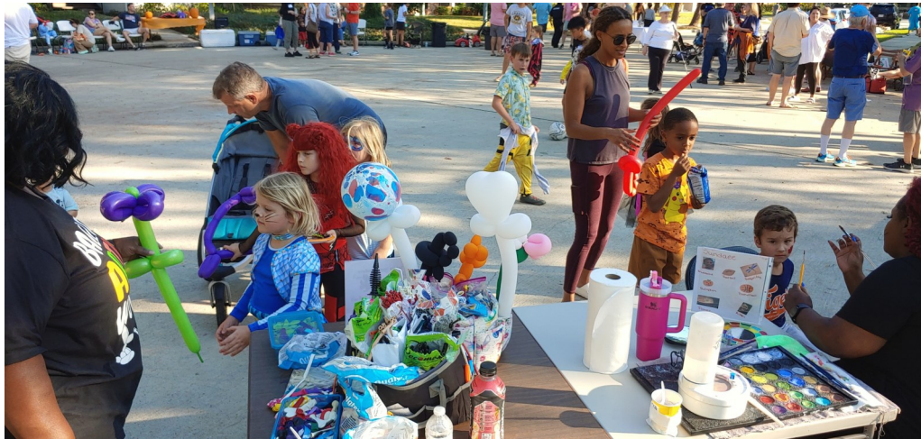
A Young and Growing Community