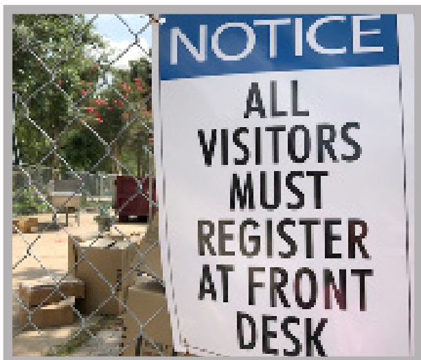
Construction does not keep the youngsters from enrolling for the Fall.

Marilyn Estates is located between Kolter and Parker School (a Music Magnet also in a new building), and Harmony Science Academy on S. Braeswood. These excellent schools will attract families with elementary age children to our neighborhood.