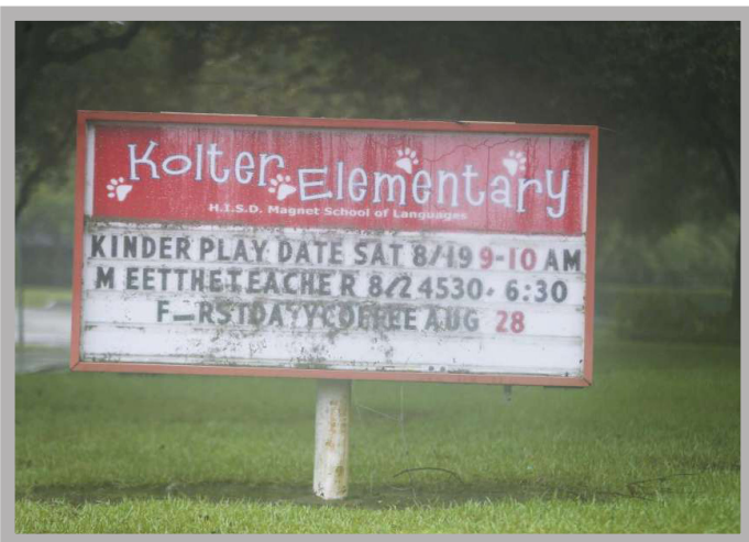
"The sign for Kolter Elementary School shows the high water level that inundated the neighborhood...Aug. 28, 2017"

Aging and "Harvey" recently forced Kolter to be demolished; it is currently an empty lot but construction will soon begin and we will all be the beneficiaries of a brand new school.