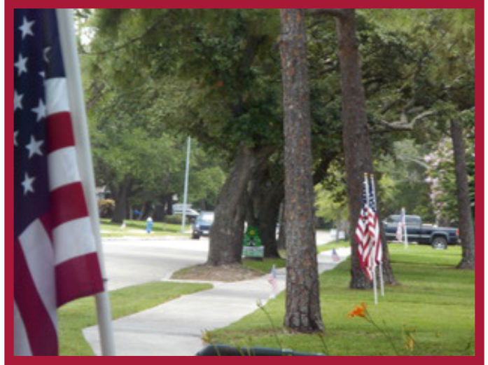
Marilyn Estate neighbors coming together to show their patriotism standing strong (Houston Strong).

For the YOTQ, we are selecting a maximum of one home per block. In order to provide opportunities to recognize more homes, the YOTQ will only be awarded to any property only one time during the calendar year.