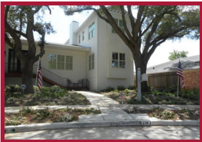
Qualifier for YOTQ, a beautiful show of patriotism for Marilyn Estates