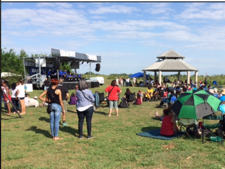
Neighbors and friends listen to the sounds of the festival