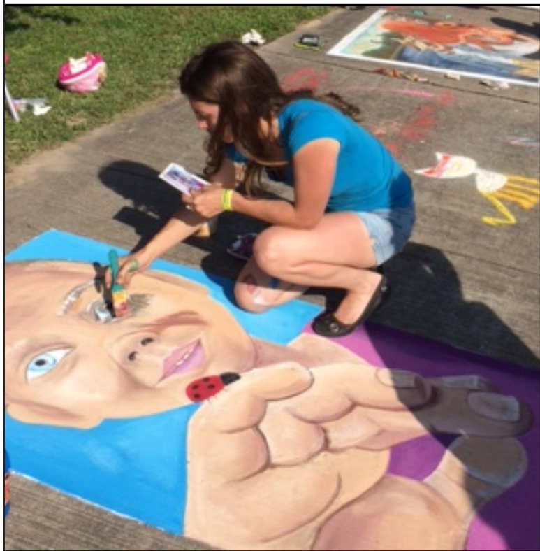
Sidewalk artists coming together to create masterpieces

Excellent weather, food trucks, music, craft booths, a great family day.